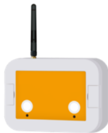
Main Unit (Standard Type) ※1