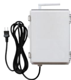
Main Unit (Waterproof Type) ※1