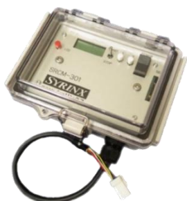
SRCM-301R (main body)