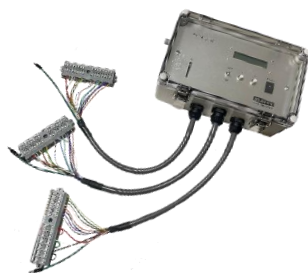
SACM-31FB (Main body)